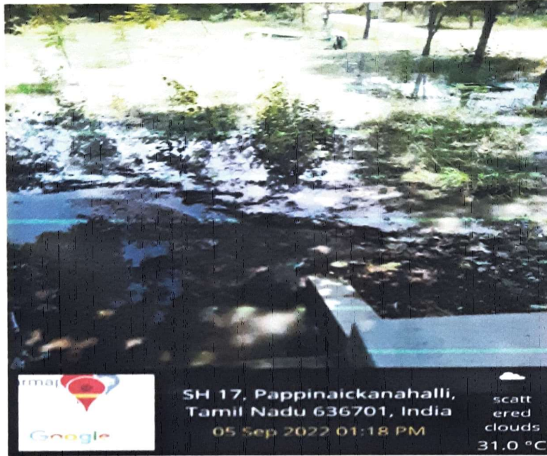
Rain Water Collection Junction

There are 2 rain water collection ponds maintained inside the campus at selected sites. This structures aid in storing the water collected through seepage and ultimately replenishes the ground water table.